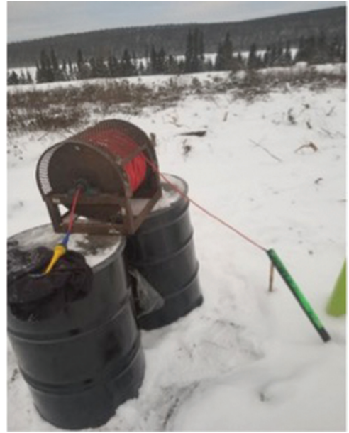
Figure 1 Illustration of the spool and the wireline holding the fluorometer

The ground elevation at site is around 1600 mamsl and the natural pre-mining piezometric elevation was around 1390 mamsl, nominally 210 m below the ground surface. In 2018, the total dewatering rate for the mine was of 18900 L/min, pumped from 11 conventional wells. Pumping these 11 wells caused an average drawdown of ≈