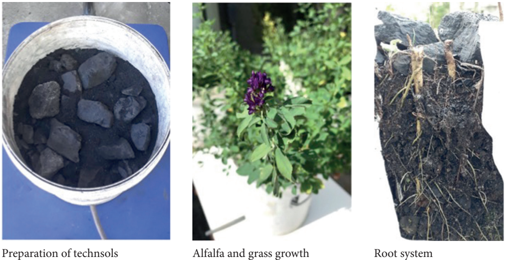
Preparation of technosols