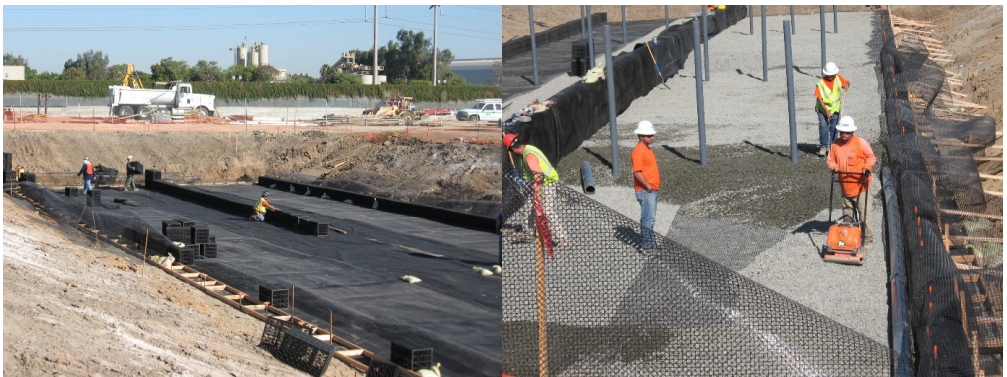
Figure 1 Example construction of a subsurface GBR™.

Operation of the GBR™ consists of monitoring and sampling influent, effluent and GBR™ geochemical conditions (flow