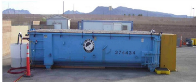
Figure 3 Example of a GBR™ pilot test system.

A subsurface GBR™ system was designed and implemented to treat selenium in an urban stream. Selenium had been mobilized from anoxic sediments that were exposed to atmosphere during urban development of the area. Laboratory treatability studies were conducted to evaluate potential methods to reduce selenium concentrations to <5 µg/L and reduce nitrogen loading by 50%. Initially mesocosm studies confirmed potential to reduce selenium in sediment mixed with organic material (electron donor). Subsequently, column studies were