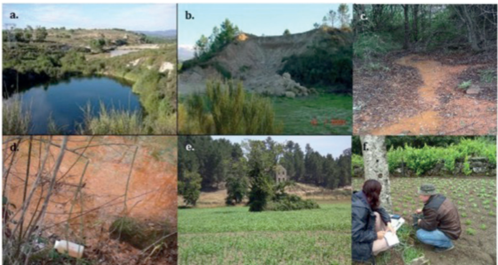
Figure 1 Field images illustrating the old abandoned mine area of Ribeira do Bôco (Central Portugal): a. open pit lake; b. mine dumps; c, d. water mine with ochre-precipitates; e. vegetation and crops; f. well in an agricultural area.

The area has rural characteristics with vegetation that is dense and mainly with herbaceous species (Fig. 1e). Around the abandoned mine, small agricultural areas occur with potato crops, vineyards, and pastures (Fig. 1f), which are irrigated by the Ribeira de Bôco stream and wells located in the stream margins.