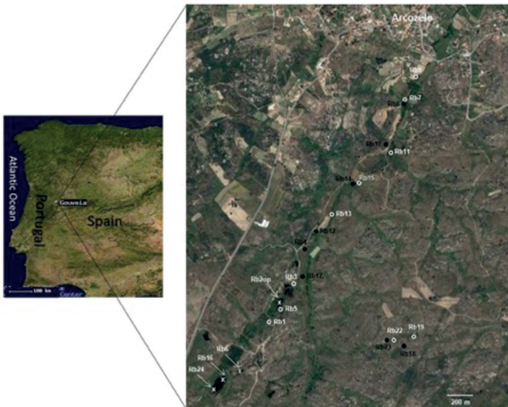
Figure 2 Geographical setting of studied area (Central Portugal) and location of water sampling points (Rb): x – open pit, o – surface water, • – well.

Temperature, pH, Eh, and electrical conductivity (EC) were measured in situ using a multiparameter HANNA HI929828 model. The water samples were filtered through 0.45 µm pore size membrane filters. Those for the determinations of major and trace elements (e.g., Ca, Mg, Fe, U, Th, As, Co, Cd, Pb, Cu, Zn, and Mn) were acidified with suprapur HNO 3 at pH 2 and analysed by Inductively Coupled Plasma Optical Emission Spectrometry (ICPOES), using a Horiba Jovin Yvon JV2000 2 spectrometer. Anions were determined in non-acidified samples by ion chromatography with a Dionex ICS 3000 Model. Duplicate blanks and laboratory water standards were analysed to assess quality control of the obtained results. The accuracy of the methods was verified using certified patterns and the measurement precision was greater than 5%. The laboratory water analyses were obtained at the Department of Earth Sciences, University of Coimbra, Portugal.