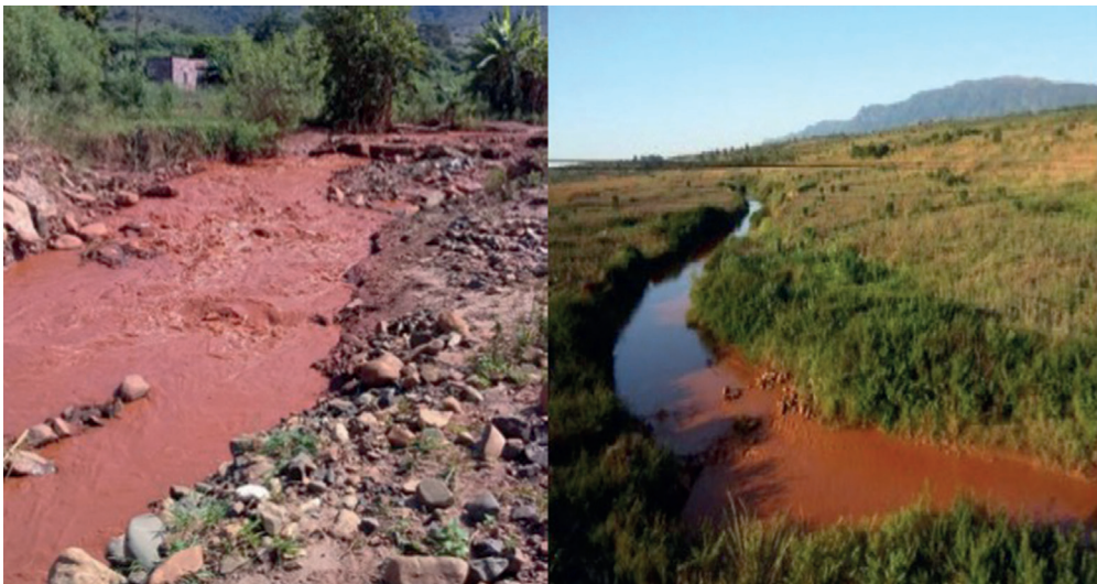
Figure 1 Revué River (right) Chua River (left) (image: Bruno Paqueleque).

Artisanal mining in Manica District is not organized due to limited legislation and its weak implementation. The rivers are highly affected due to inappropriate techniques during extraction and processing of gold. Gold is processed and washed in the rivers and it leads to high turbidity, and concentration of solids and metals, Figure 1. Additionally, mercury is used for artisanal gold processing in artisanal gold mining and it also contaminates the water of the rivers. Some industrial gold mining companies are mobile and do not have environmental management plans that makes environmental monitoring and protection inefficient (Castigo & Fopenze 2017).