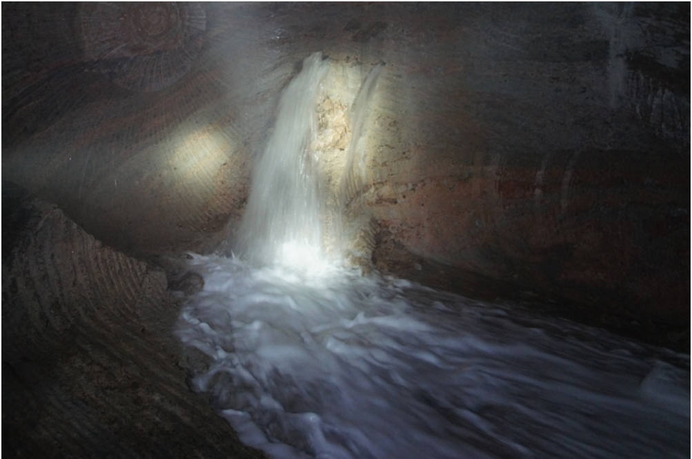
Figure 1 The brine in the operational development in the direction of the panel number 2.

Also, the brines contained in the lower part of the section of the super-salt rock can penetrate into the underground mine workings. Mining brine shows that have a