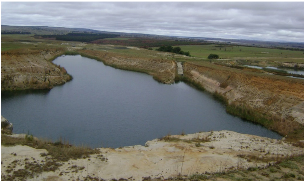
Plate 3: Rooikop Pitlake Nov 2017.