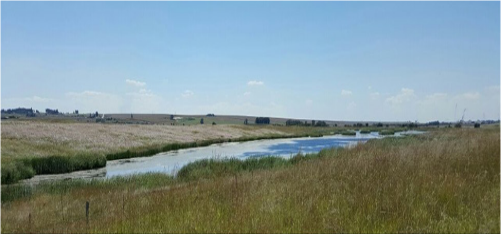
Plate 2: Kriel Pitlake 4: Ramp 44 North, looking North, 29 March 2017.