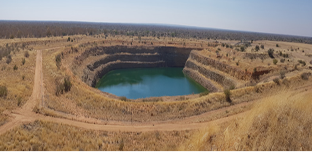
Plate 1: Mafutha Pitlake: (September 2018).