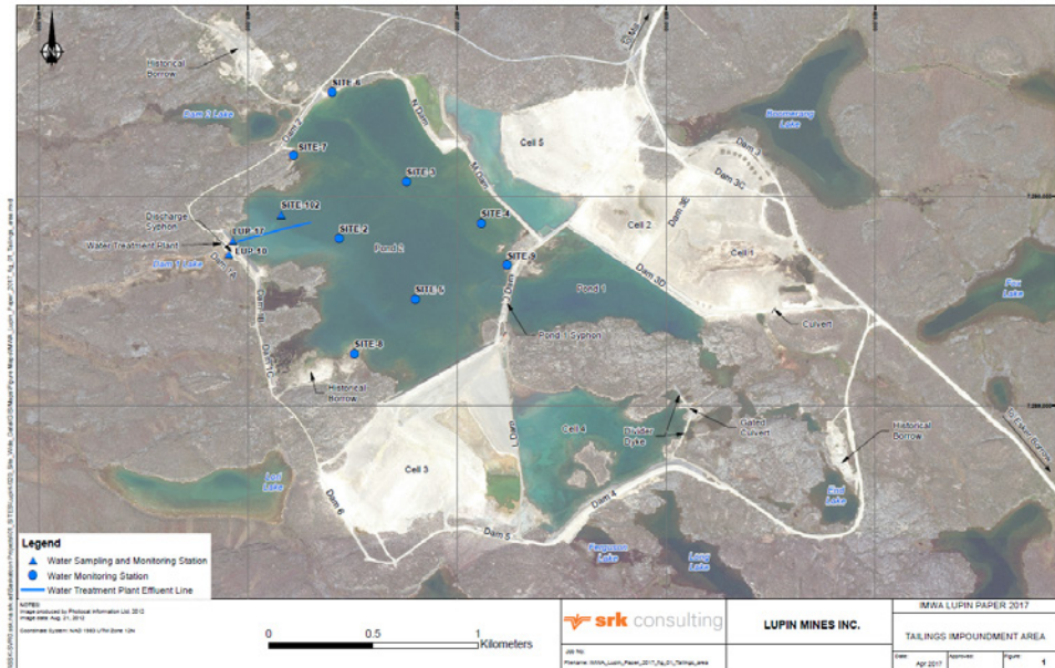
Figure 1 Lupin Mine Tailings Impoundment and Sample Locations

The buffering capacity of the Pond water is very low. Before treatment in 2012 and 2015 water quality data was collected and the alkalinity was <5.0 and <2.0 mg/L as \text{CaCO}_3 , respectively. In order to raise the pH of the Pond hydrated lime was added (Pouw 2014). The introduction of \text{OH}^- ions into solution consumed acidity (Aubé 2003). Since there was very little alkalinity in solution to buffer the \text{OH}^- addition the pH of the solution increased dramatically with small doses of lime (Stumm 1996). The limited buffering capacity means the target pH for treatment can be easily overshot.