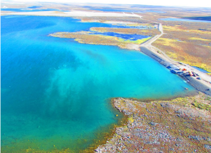
Figure 3 The Bay area in Pond 2 during the 2012 Treatment Campaign