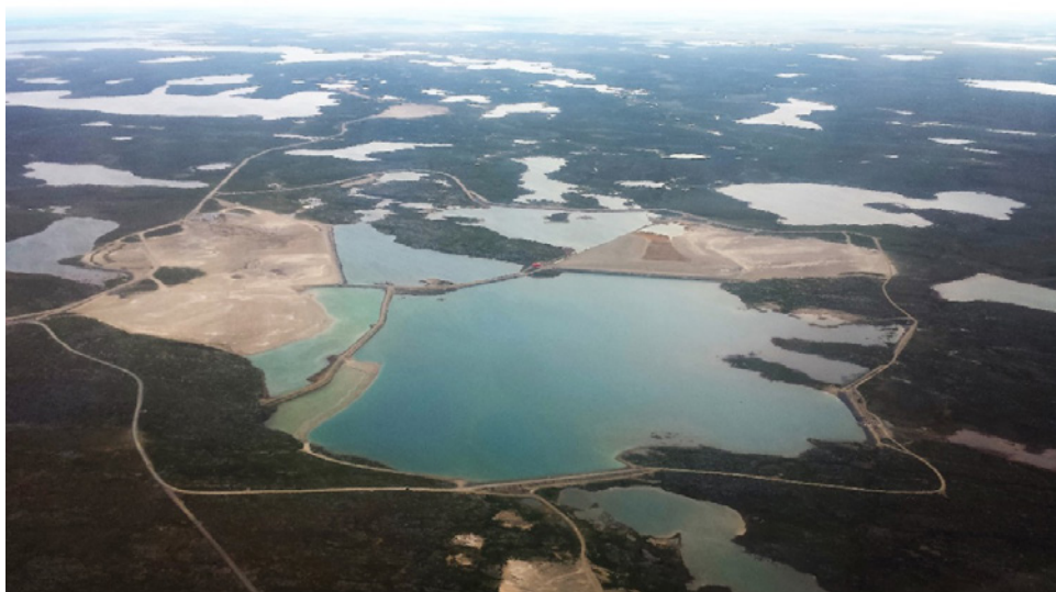
Figure 2 Lupin Mine Pond 2 of the Tailings Impoundment Area

equilibrated with atmospheric carbon dioxide and mix with the portion of untreated Pond water. The pH decreased into the acceptable range for discharge. Pond water was transferred via two 20" siphons from a depth of 3 m off Dam 1A to Dam Lake, ultimately reporting to Contwoyto Lake.