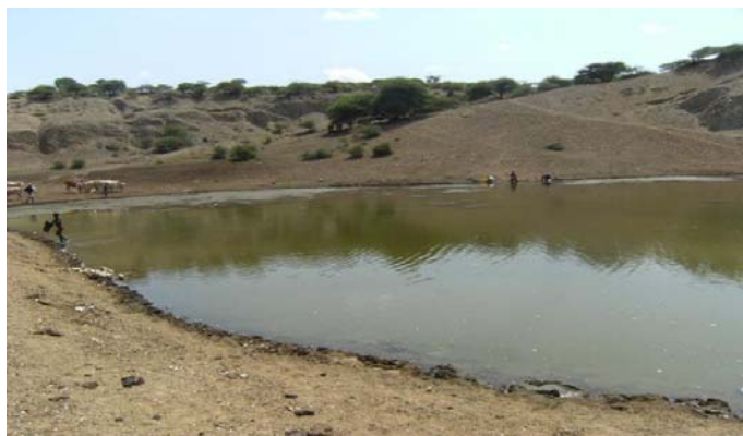
Fig. 2 showing livestock and people collecting water and washing clothes around the soda pit 2