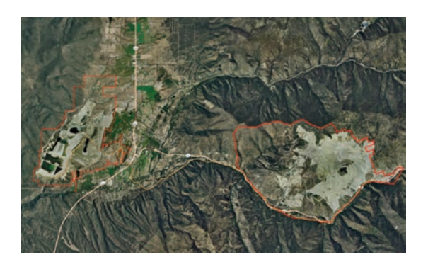
Fig. 2 Administrative Dataset display.

GIS projects with the same coordinate system, thereby allowing the image to align for digitizing.