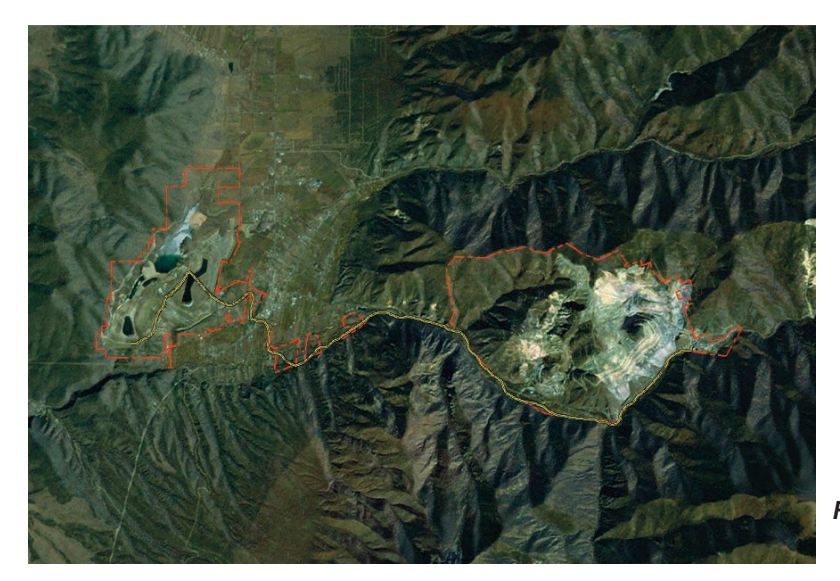
Fig. 7 ArcReader Default Appearance

ronmental datasets since they are now located in one geodatabase. Before, many of the datasets were on hard copy maps or in Auto-Cad files. Adding to that benefit, is that all of mine staff has access to a database resource that can be used for disseminating and analyzing environmental themes in a very prescriptive regulatory environment. This has resulted in the staff becoming more aware of environmental monitoring locations, monitoring requirements, as well as providing a spatial product via the ArcReader application.