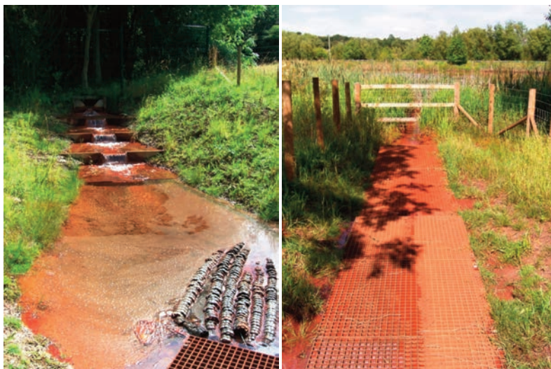
Fig. 1. The Saltersford SCOOFI Reactor System showing the aeration cascade and settling pond to the left and media channels to the right; several SCOOFI media chains are visible in the bottom right hand corner of the settling pond.

the flow of water both up and down through the SCOOFI media. Two different configurations of SCOOFI media have been used in this trial to facilitate easy handling and maintenance of the scheme; nylon mesh bags and SCOOFI chains. The results of the trial discussed here are divided into three sections, a) Bagged Media, b) Bags vs. Chains and c) Media Chains. For one week in March 2012 (20/03/12 – 27/03/12), the system was emptied of media to ascertain the effectiveness of the scheme infrastructure to remove iron. During this period it was established that the small cascade and settling pond removes on average 2 mg/L of iron with a small amount of ochre also precipitating in the channels. The following discussion will therefore focus on the water chemistry of the inlet and outlet of the SCOOFI media channels.