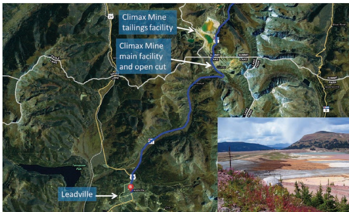
Fig. 3 Location of the Climax Molybdenum Mine. Distance from Leadville to the Climax Mine is approximately 21 km (13 mi). Inset is a view of the tailings facility. Map base is from

( www.epa.gov/Region8/superfund/co/cal-gulch ). The California Gulch Superfund listing is divided into 12 operable units and includes 46.6 km 2 of Lake County, Colorado. As of September 2011, remediation efforts at four of these operable units have been declared complete.