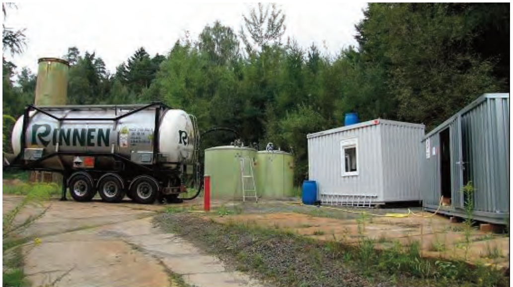
Figure 3 Mobile facility for producing and injection of reactive solution (left to right: mobile container for caustic soda, storage tanks, dose and station, moistening station).