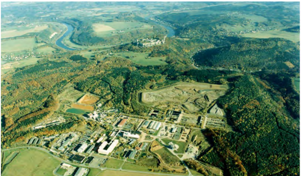
Figure 1 View of the Königstein mine site/Germany.

To date, the mine is in a partly flooded state. Some 4.5 million m 3 of a total volume of 11 million m 3 of mine voids subject to flooding are currently