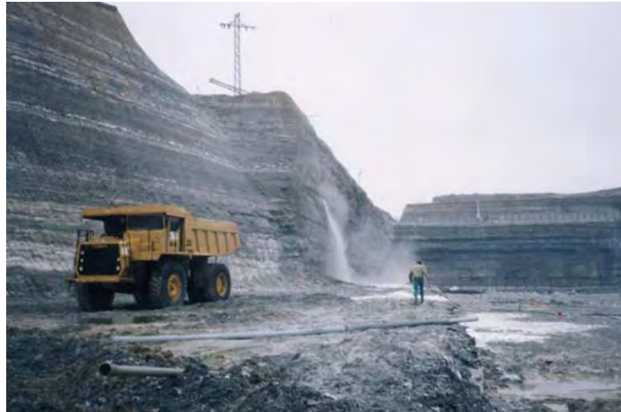
Picture 2 General view of the pool