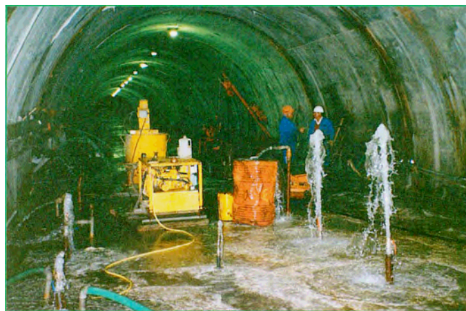
Picture 1 Injection process at the inspection gallery

This treatment is based in waterproofing of the joints or fissures by filling the existing hollow by means of water reactive polyurethane resin injections. At the beginning of the foam reaction the detachment of micro bubbles of CO 2 suit the expansion in volume and the infiltration in all the gaps, even in the smaller micro fissures of the structure to be treated. Once the process has been finished the result is a solid, elastic and very stable in time mass.