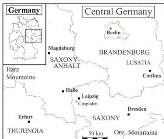
Figure 1: Location of the study area in Central Germany (after Schreck 1998)

The mining area Cospuden is situated on the southern border of Leipzig within the Central German Lignite District (figure 1). It covers an area of about 4 km 2 . Mining of the Tertiary lignite occurred from 1980 to 1990.