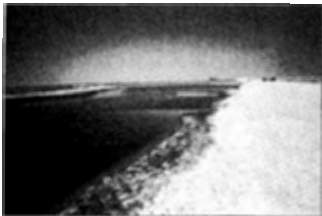
Figure 1. Sedimentation pond. On the bottom emergency plant.