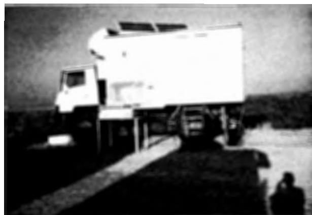
Figure 3. Mobil Laboratory on the Emergency Plant.

CHG divided the Entremuros surface in three areas