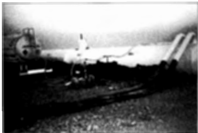
Figure 4. ITGE Emergency Plant.

building two coffer-dams, one in the Vaqueros bridge and the other in the middle of the first one and the retention dike. The area of the down-stream was considered as polluted water and therefore an area to treat. The area of up-stream contained water with values that allow the direct pouring out. The intermediate area contained water situated in the established limit to perform a direct pouring out. Two pumps were installed, one with a piping for a direct pouring out and another to pump out water to the polluted water area.