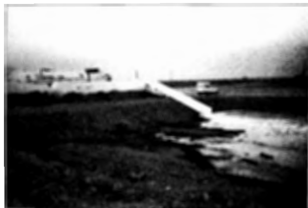
Figure 5. ITGE Emergency Plant.