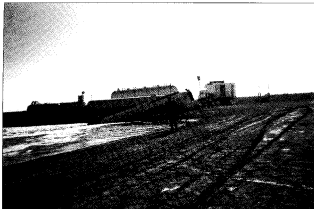
Figure 6. ITGE Emergency Plant and Mobil Laboratory.